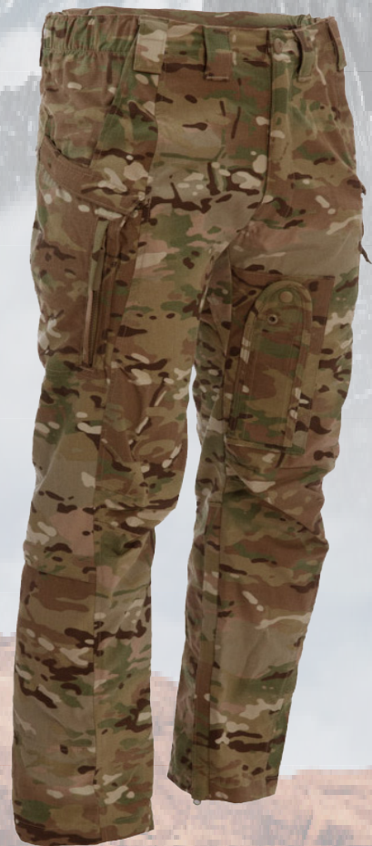
PART # MPNT00069